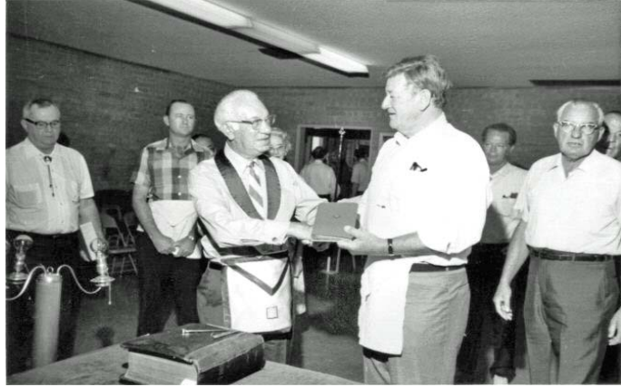
This is a picture from an unknown source showing John Wayne receiving his Masonic Bible at Marion McDaniel Lodge #56 in Tucson, AZ, July 1970.

In 1959, Wayne was personally told by Nikita Khrushchev, when the Soviet Premier was visiting the United States on a goodwill tour, that Joseph Stalin and China's Mao