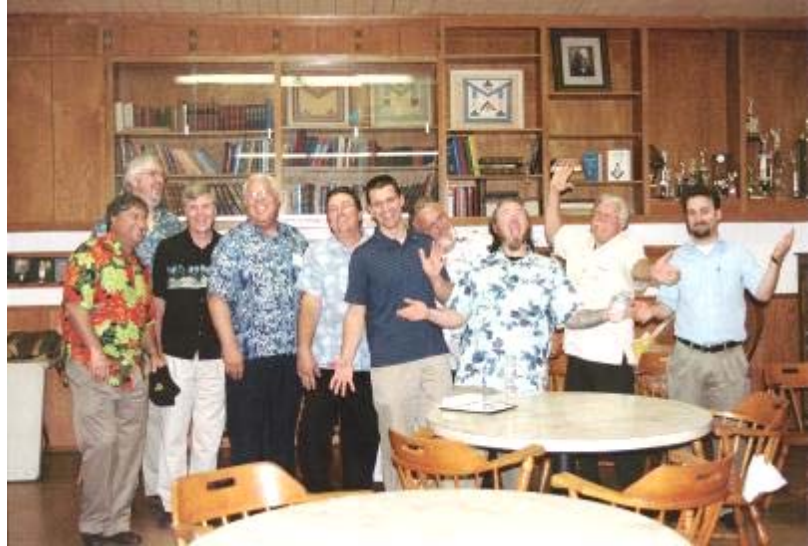
As usual, the brothers don't take themselves TOO seriously!