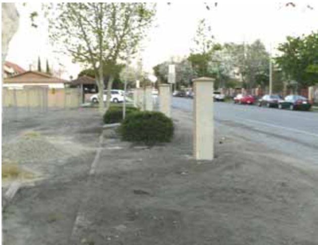
The front of the lodge property is a changing'.