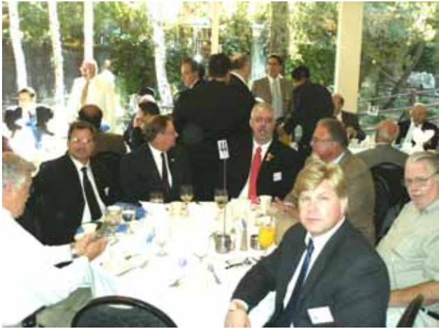
Our table at the LAMSB breakfast honoring the Grand Master. This year it was held at the Sportsmen's Lodge.