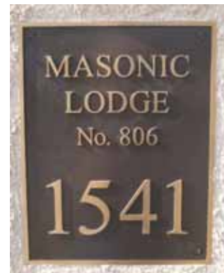
The plaque on the right hand pillar as you enter the lodge parking lot.